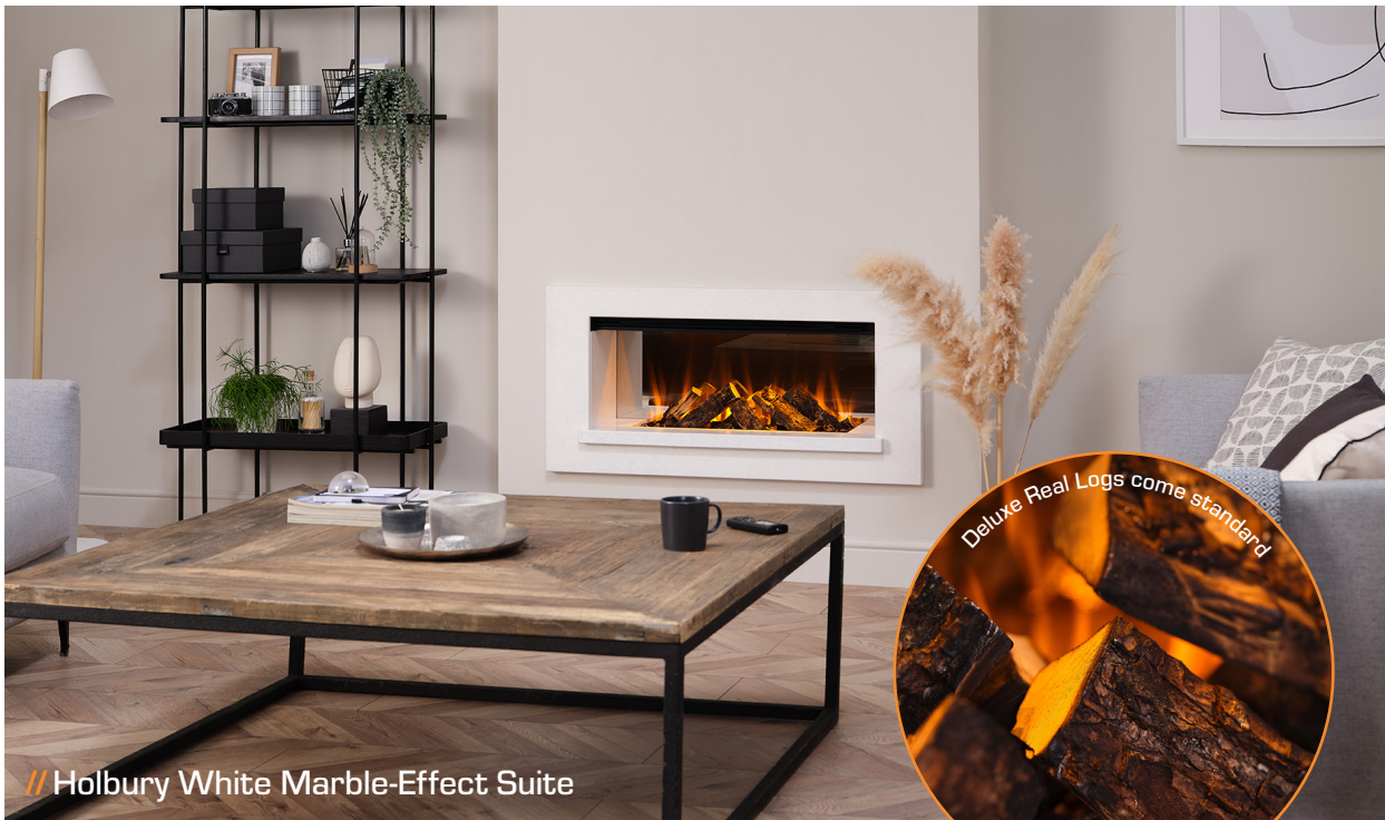
// Holbury White Marble-Effect Suite